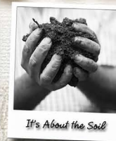
It's About the Soil