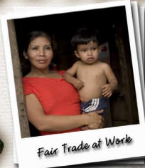
Fair Trade at Work