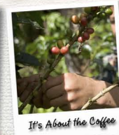
It's About the Coffee