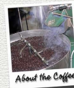
About the Coffee

Nectar of Life Coffee Company is the Inland Northwest's first 100% Kosher, organic, Fair Trade certified coffee roaster. We are partnered with Catholic Relief Services (CRS) Fair Trade and donate a percentage of sales from certain accounts to the CRS Fair Trade Fund. 100% of monies donated to the CRS Fair Trade Fund go to help disadvantaged farmers and artisans throughout the world. Fair Trade assures that farmers receive a fair wage for their hard earned crop.