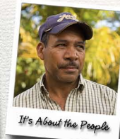
It's About the People